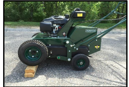
FIGURE 1: Level engine for proper oil check. This picture uses 2 2x4's under the front tires to level the engine.

This Quick Tip is only a guide, always refer to your Operators Manual